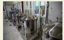
Red Ginseng extraction