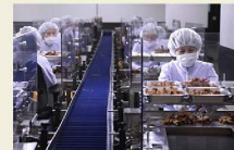
Stringent selection of raw materials