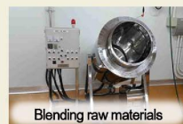
Blending raw materials