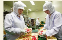
Strict quality inspection