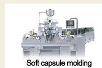
Soft capsule molding